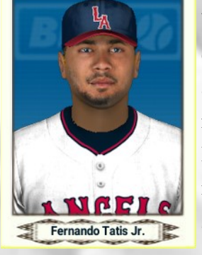
Los Angeles Angels

a .310/.369/.431 slash line over more than 1500 games. The rest of the 51' season should be a good dogfight between the Brewers and Rockies, may the best team come out on top.